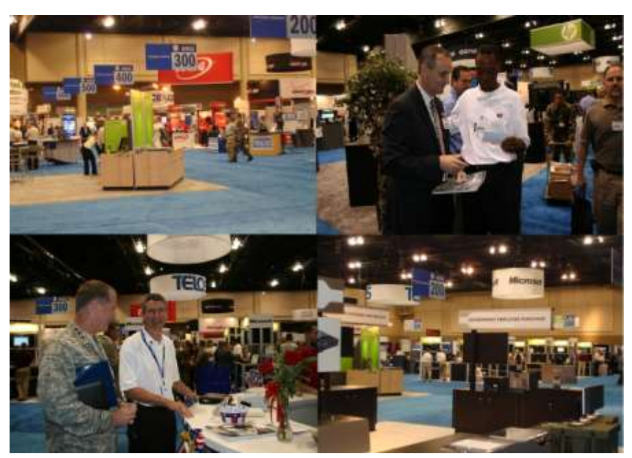
24-27 August 2009 (Renaissance Montgomery Hotel & Spa)

AF IT – The Warfighter's Edge in Battlespace